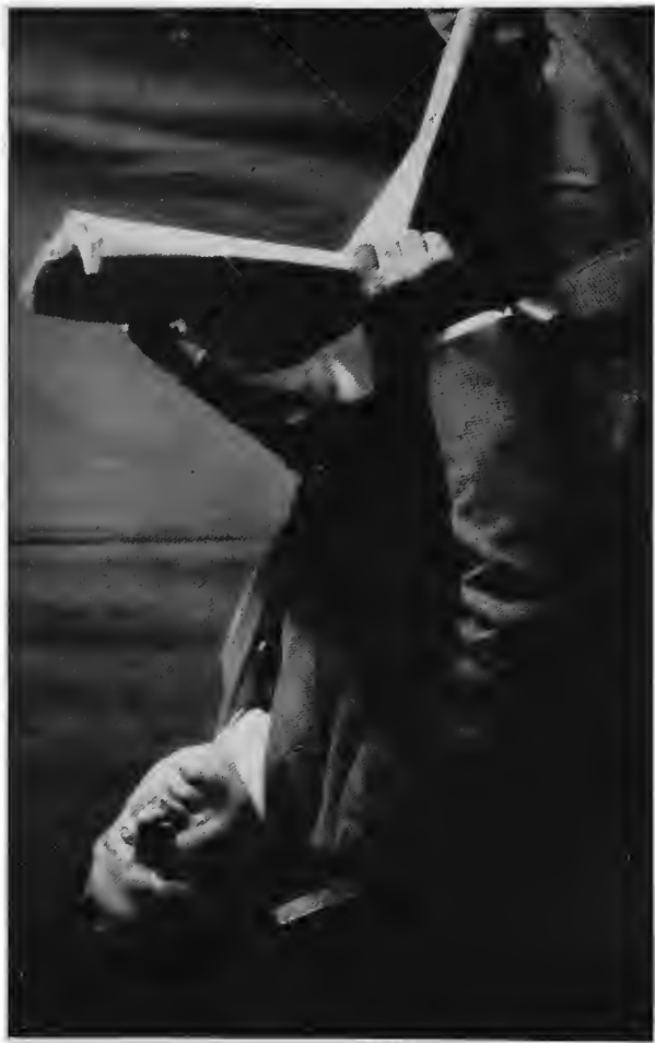
O. Henry. A characteristic photograph.